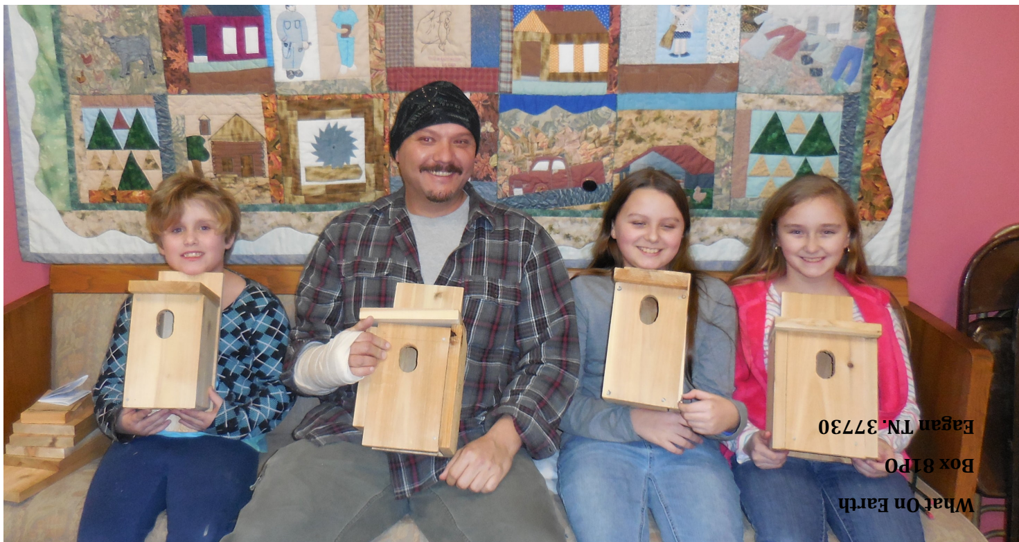
Participants with Birdhouses made during the TWRA workshop