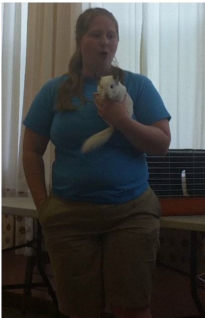
Chinchilla from the Zoo mobile