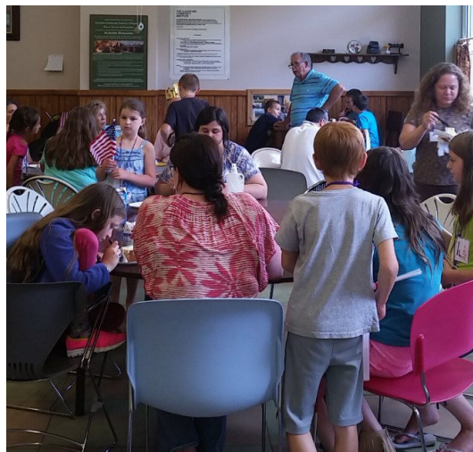
Lunch being served in the kitchen